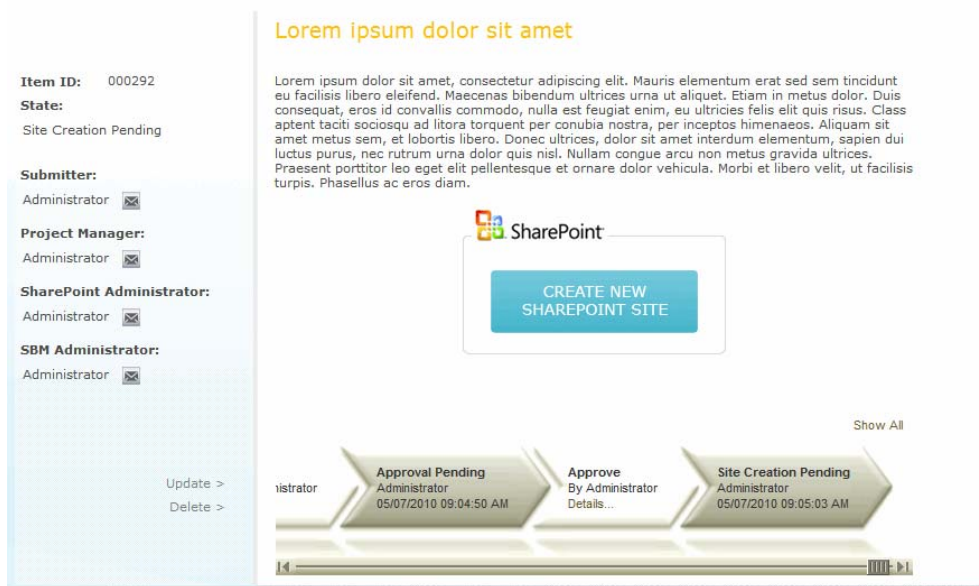
Figure 4 – After completing approval workflow activities

The creation of the SharePoint portal is fully automated by SBM and will be initiated by the user clicking the blue button called “Create New SharePoint Site”. All meta data associated with the creation and approvals process will be captured within SBM for later reporting.